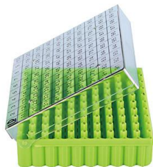
PC Freezer Box